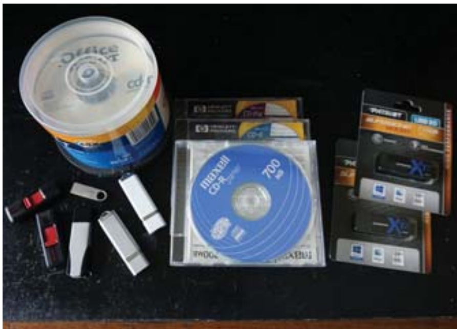
Besides cloud storage, media selection to store scanned documents

Gather your electronic devices, keep them charged and take them with you as